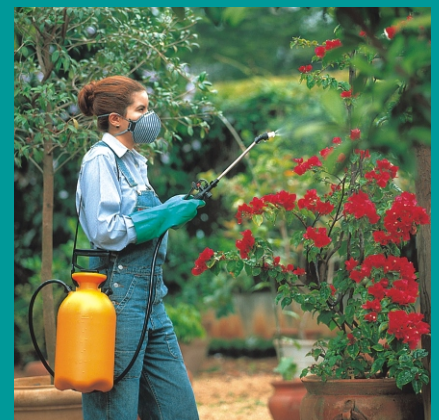
Application with the 6-litre model - code 418.02