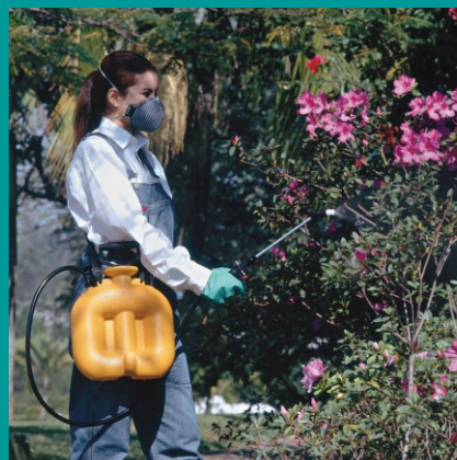
Application with the 4-litre model - code 417.02