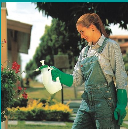
Application with the 1-litre model - code 424.00