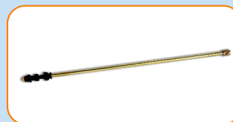
Code 4748 Telescopic boom 0.66m to 1.24m