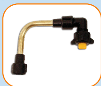
code 4750 Boom with swivel nozzle rotative 360°