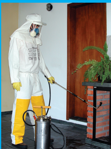
Spraying with curved 120° boom