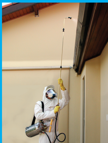
Spraying with curved 120° boom and telescopic boom