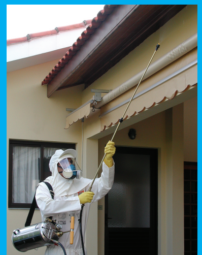
Spraying with telescopic boom