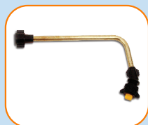
code 4751 Curved 120° boom