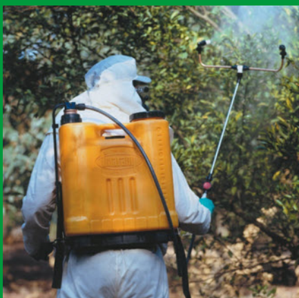
Universal boom - code 9798 - optional accessory