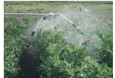
Potato boom - code 4306