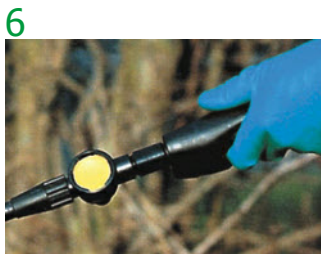
Eezispray valve - code 9984