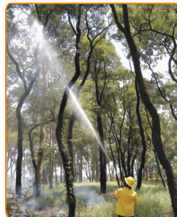
Long Distance Application