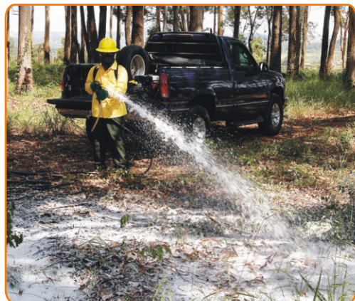
Fire Suppressant Application

Used for direct fire fighting operations in natural woods and forests, sugar cane plantations, commercial plantations, and on roadside fires and pastures. Used also for the control of isolated targets and as support equipment for setting of prescribed burns.